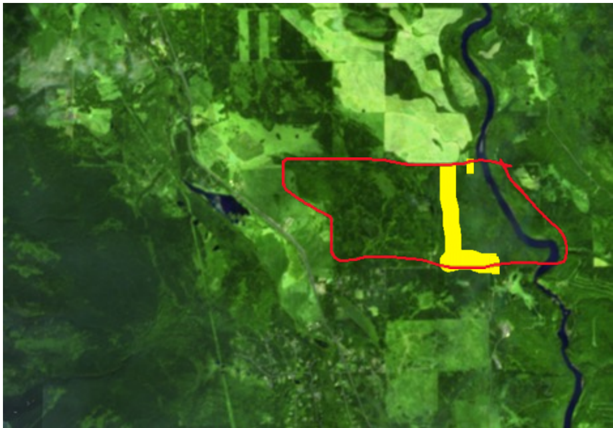
Harvested forest and cleared lands to the north and south - FID #79 and corridor in red polygon

During the past 30 years, through the management of the woodlot forest, we have gained intimate knowledge of the wildlife habitat value of this parcel and the forested corridor as a whole. FID #79 is mature forest on valley bottom which has become quite scarce over the last few years. Recent timber harvesting activities on both private lands to the south, and on agricultural leases and private lands to the north of FID #79 have now made this particular forested corridor even more important for wildlife habitat and movement. Even while moose populations have generally declined in our area, we have documented (using wildlife cameras) significant increase in winter and summer use of the FID #79 and corridor forests by moose, deer and elk, presumably because there is far less mature forest to the north or south to provide mature forest habitat and a contiguous corridor. Due to the significance of this area for wildlife, we personally have a no hunting policy on our private lands which compose part of the corridor. We have not allowed hunting and we have not hunted on this area since 1995. (See the image below to illustrate cleared areas adjacent to FID #79 taken using Sentinel Hub June 2023)