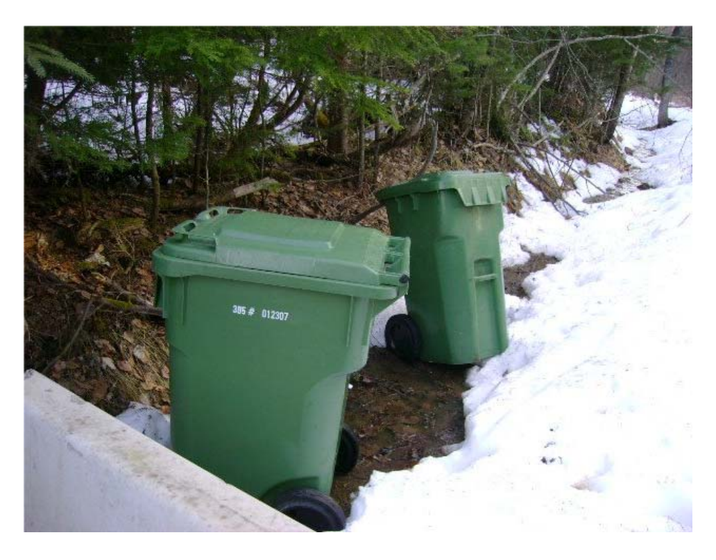
Figure 2: Garbage cans containing garbage at lower barrier 26 March 2010.