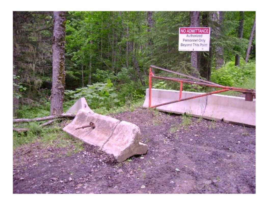
Figure 4: Block removed. Upper barrier 27 June 2009.