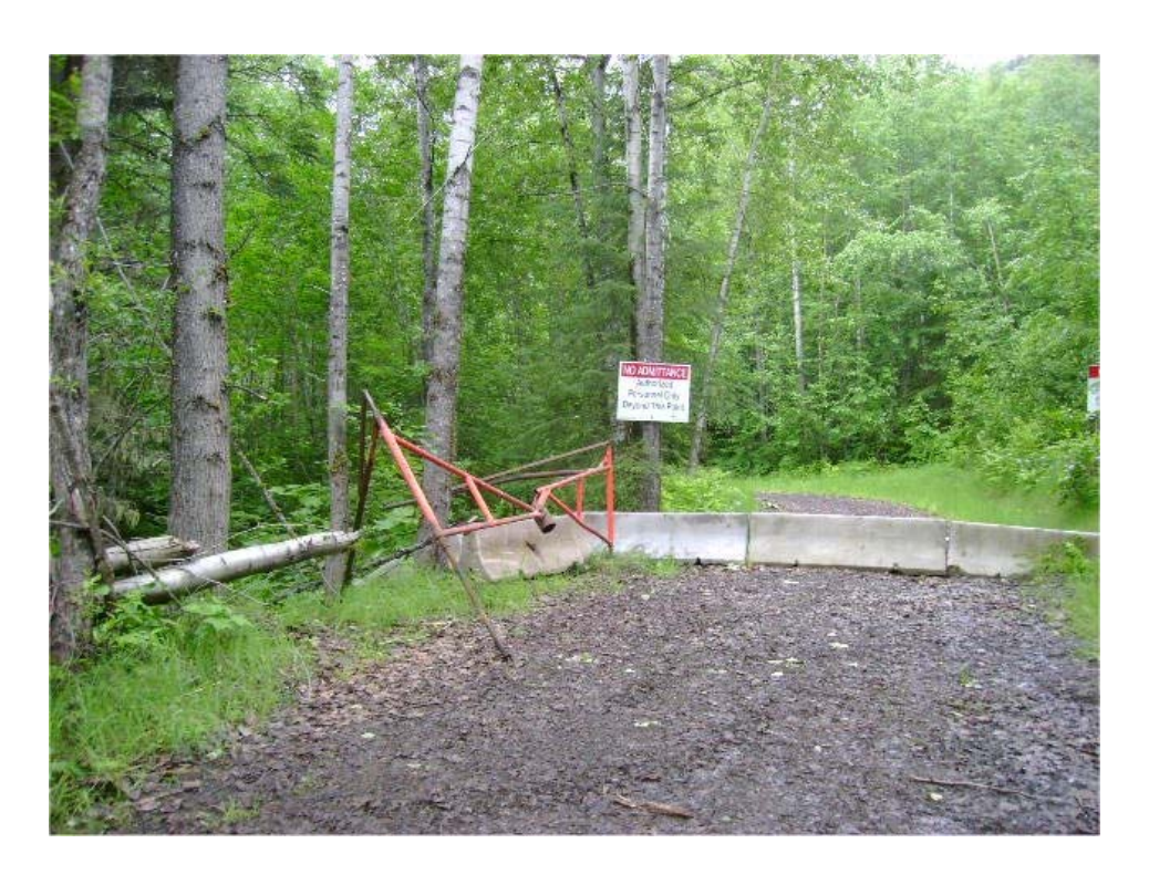
Figure 3: Gate removed. Upper barrier 30 June 2012.